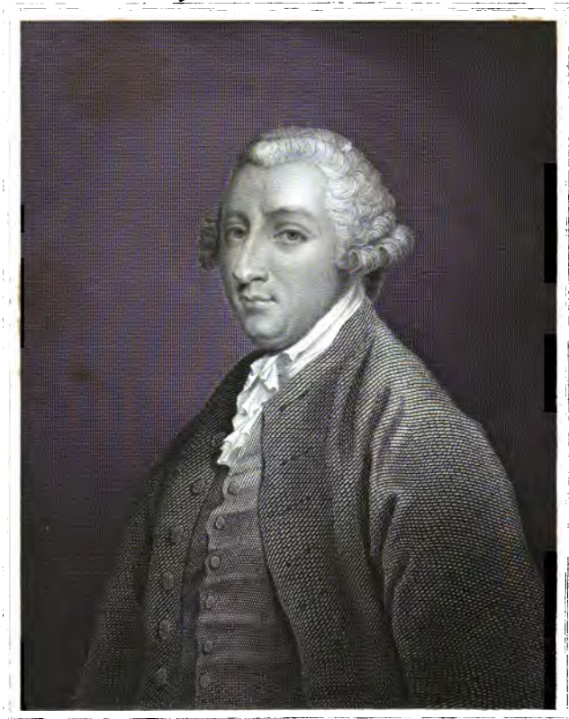
Portrait of [Name] by [Artist]

[Faint text, possibly a title or description]